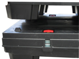
Stacking Safety Pegs